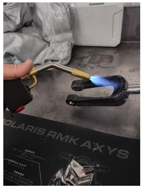
Pic #6 Pic #7 Pic #8