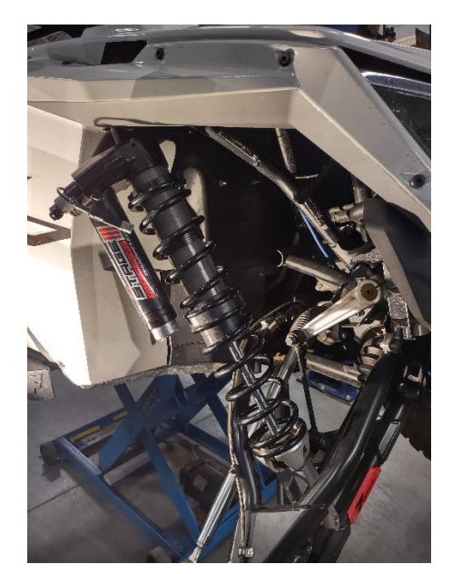
Pic #3 Pic #4 Pic #5