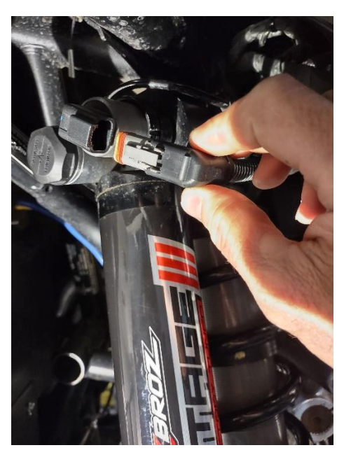
Pic #1 Pic #2