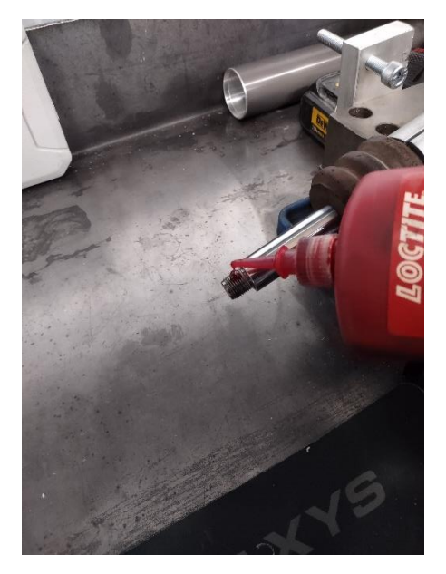
Pic #9 Pic #10 Pic #11